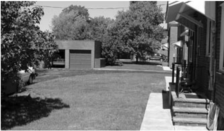
The backyard where Class Cutters entertained potential parents and children.