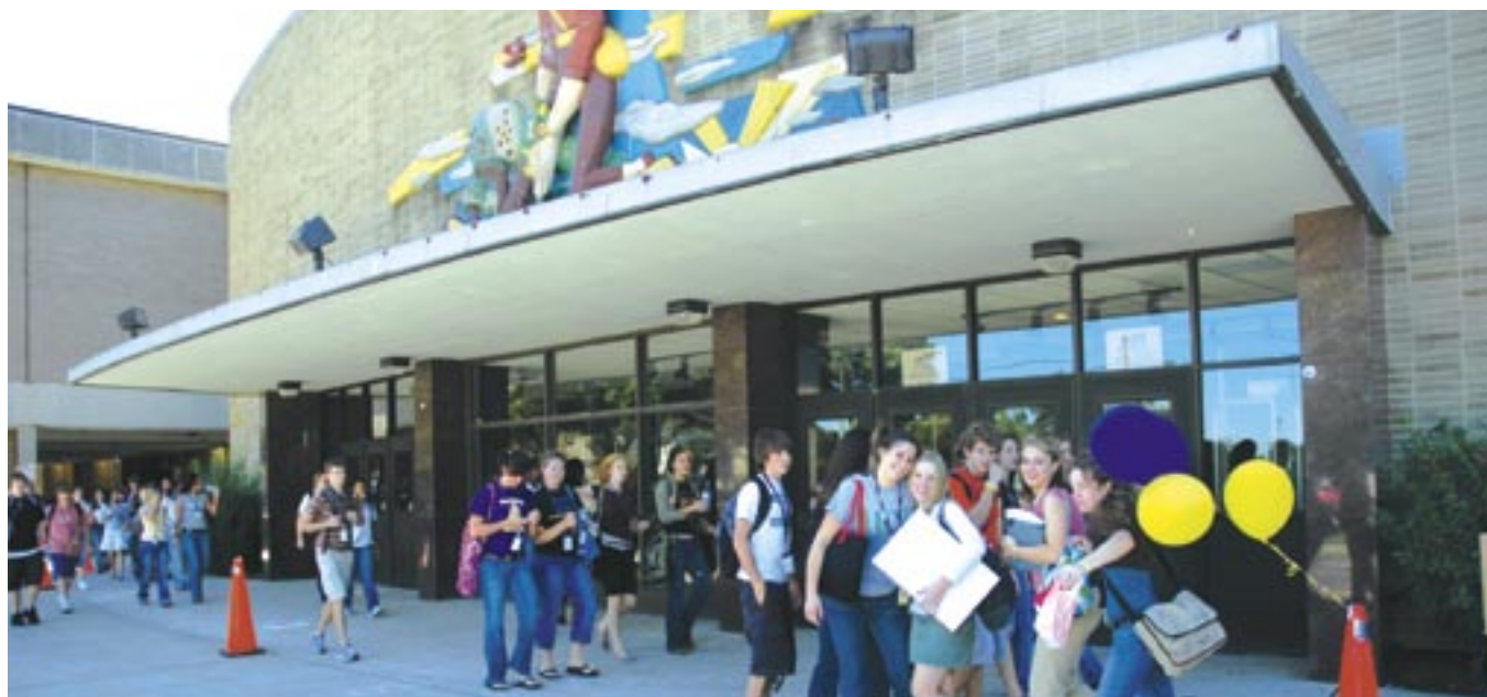
Students leaving the Junior Class Celebration last Friday, September 2. The party, which included a DJ and gift bags for everyone, was thrown to celebrate passing the OGT (Ohio Graduation Test) and Lakewood High School's Excellent rating from the Ohio Department of Education. It was great watching the students relax and have fun while their hard work was rewarded.