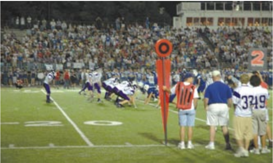
Lakewood prepares to score in the fourth quarter.